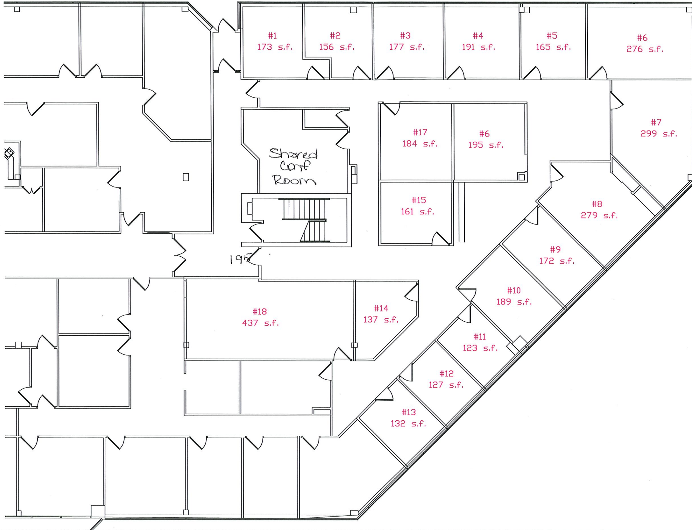
FIRST FLOOR PLAN SOUTH