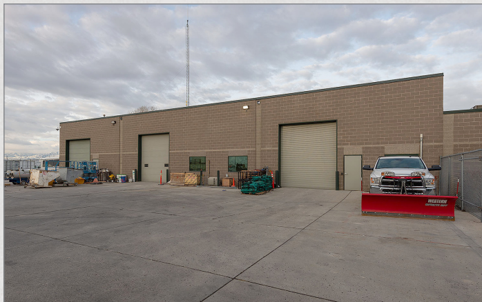
Building features 4 grade level overhead doors.