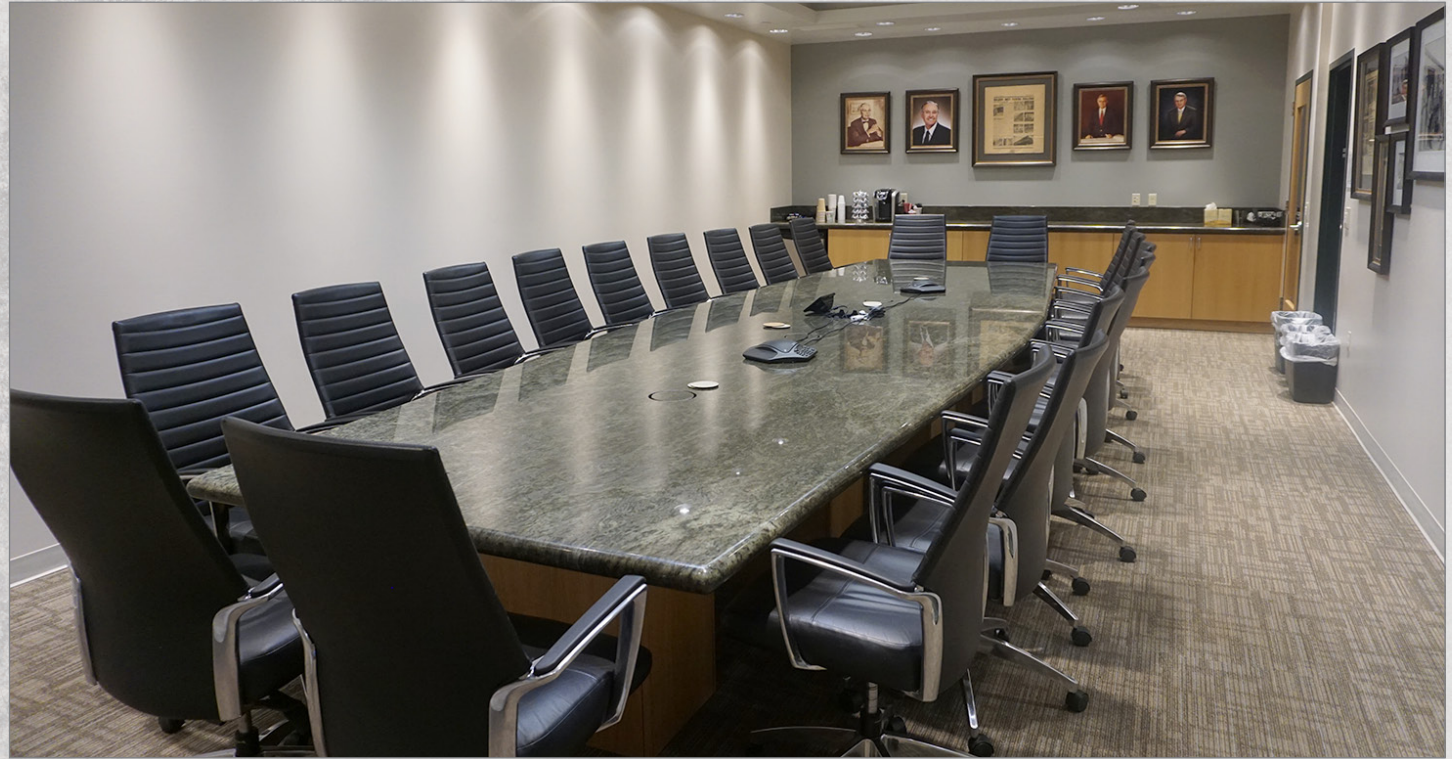
22 person executive conference room.