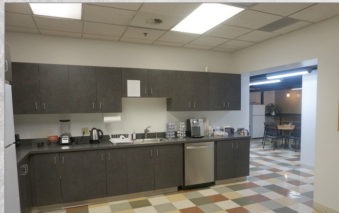
Ample break facilities.