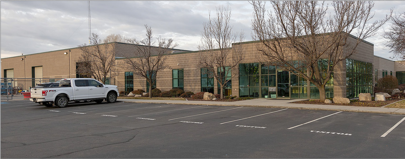
Exterior office and visitor parking.