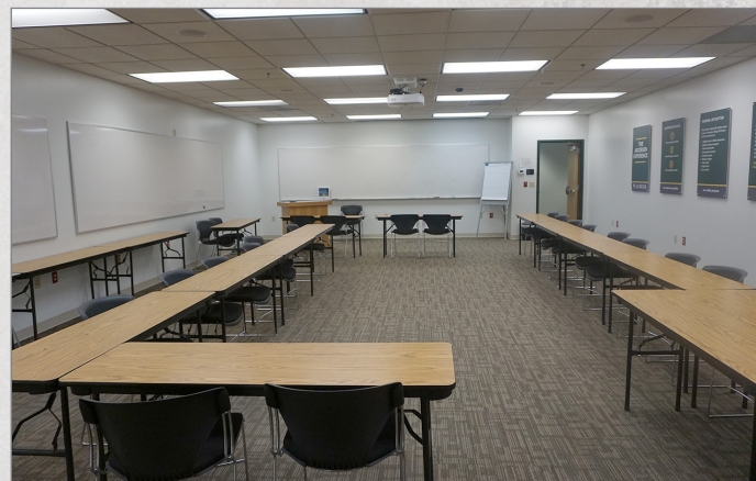
Large training room.