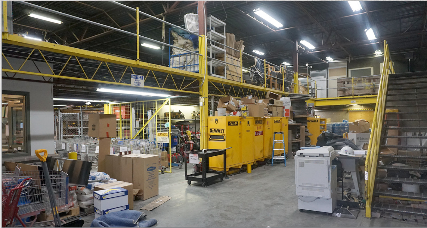
Warehouse with mezzanine.