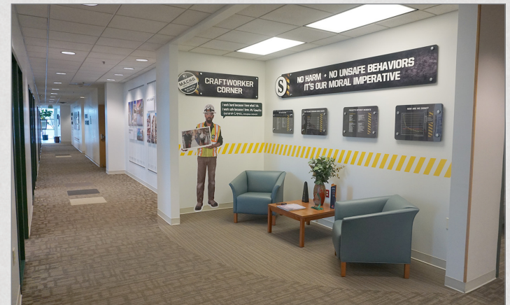
Hallway and lounge area.