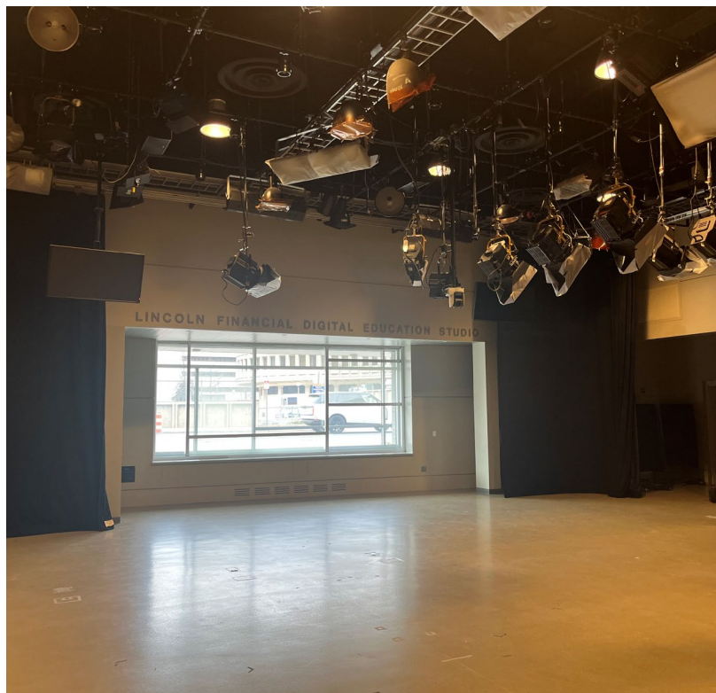
Lincoln Financial Studio