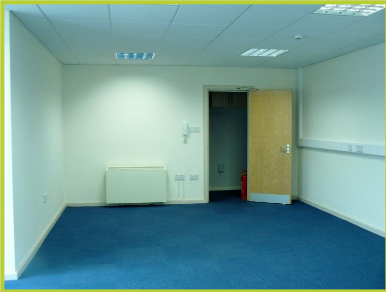
Offices at 55-57 Albert Road, Middlesbrough, TS1 1NG