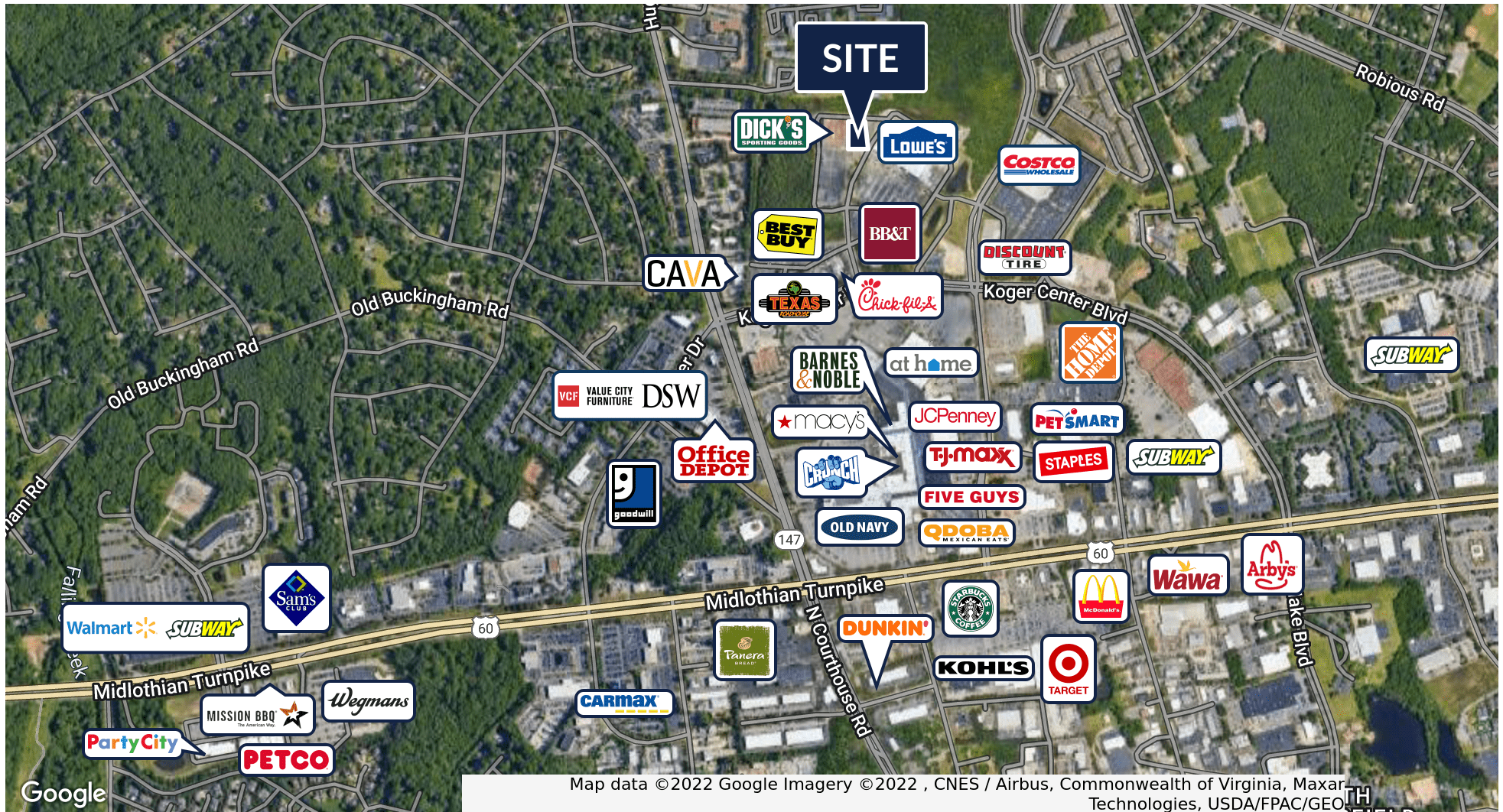
Map data ©2022 Google Imagery ©2022, CNES / Airbus, Commonwealth of Virginia, Maxar Technologies, USDA/FPAC/GEBCO

1516 KOGER CENTER BOULEVARD RICHMOND, VA 23235