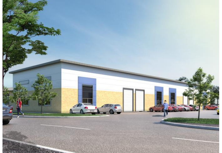
Light Industrial Units