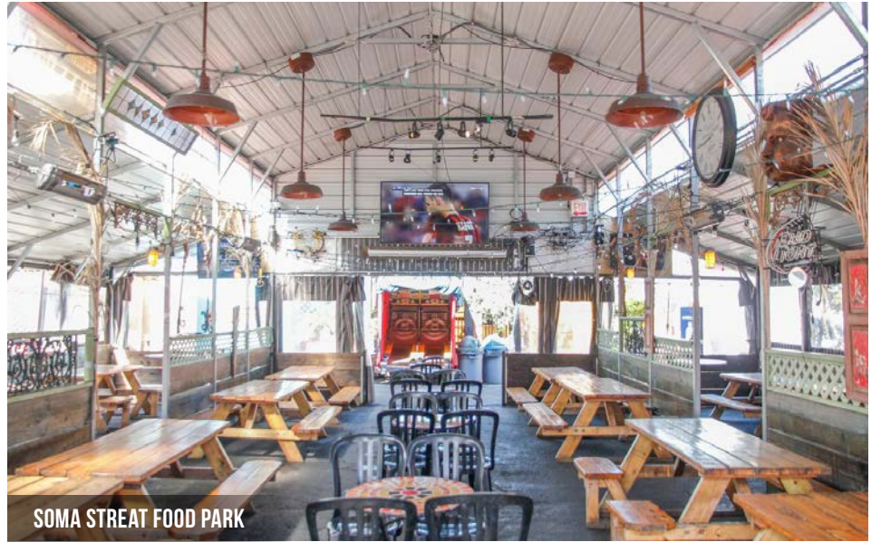
SOMA STREET FOOD PARK