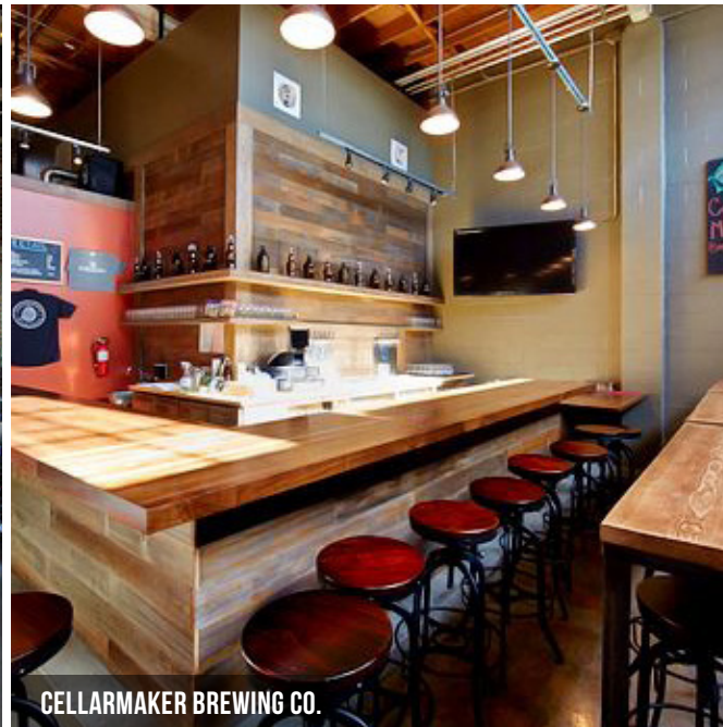
CELLARMAKER BREWING CO.