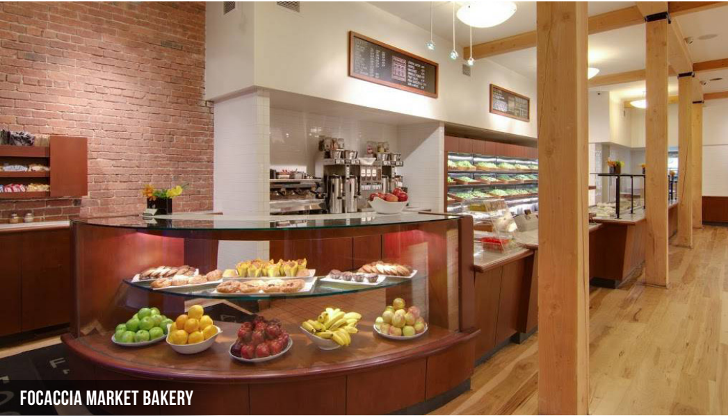
FOCACCIA MARKET BAKERY