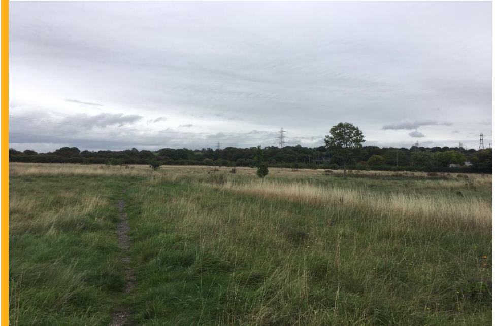
Indicative site photograph