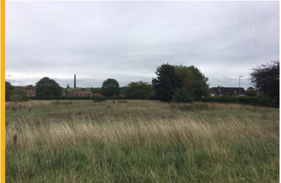
Indicative site photograph