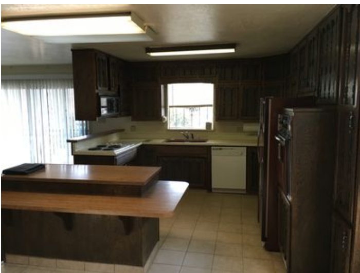
Large Unit 1