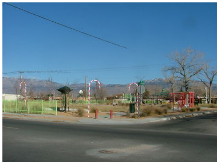
Park Across the Street