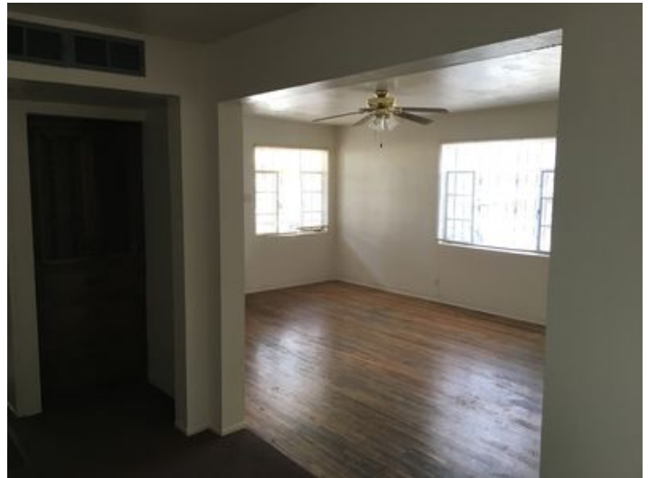
Large Unit 2