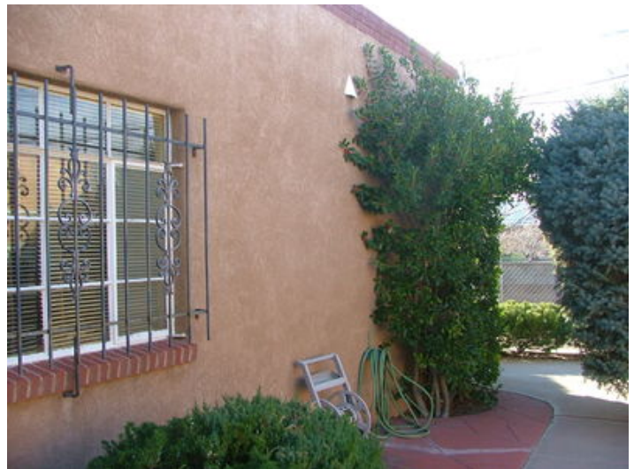
Outside of Apartment