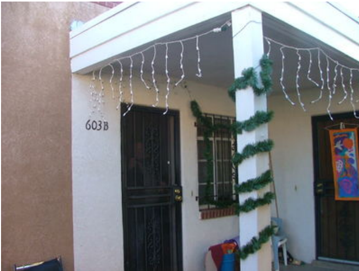
Front Porch Apt B & C