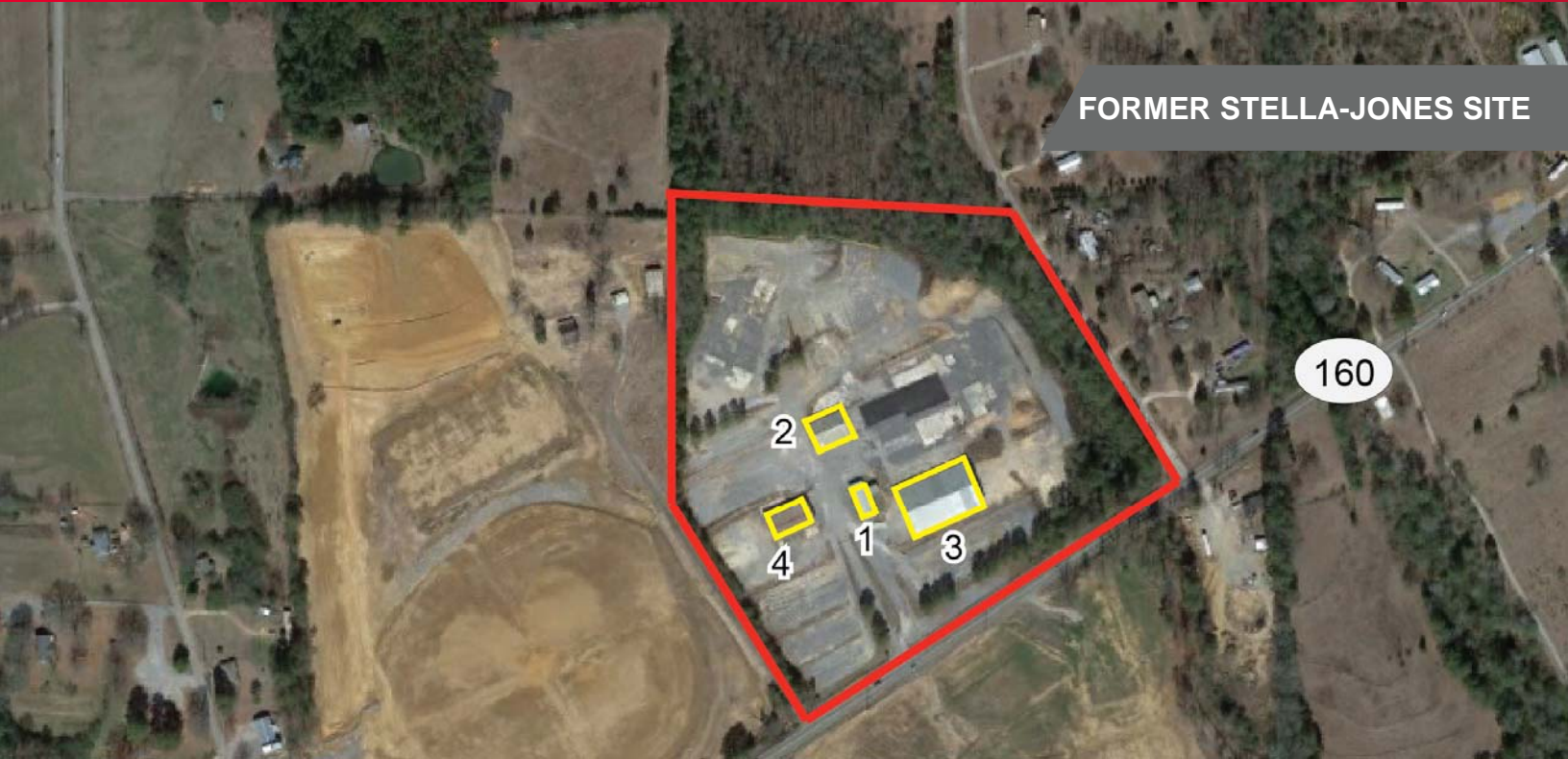
FORMER STELLA-JONES SITE