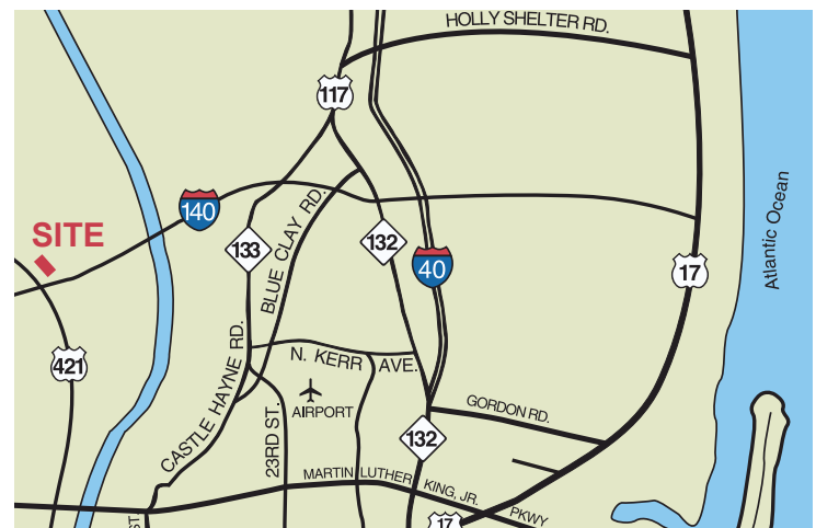
Site allows quick access to I-140 for efficient distribution.

Achieve more with top notch flex space with fast access to the Wilmington metro area.