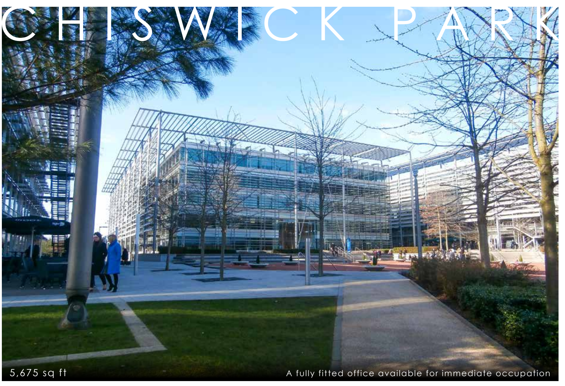
BUILDING 4 | Chiswick Park | 566 Chiswick High Road | London | W4 5YA