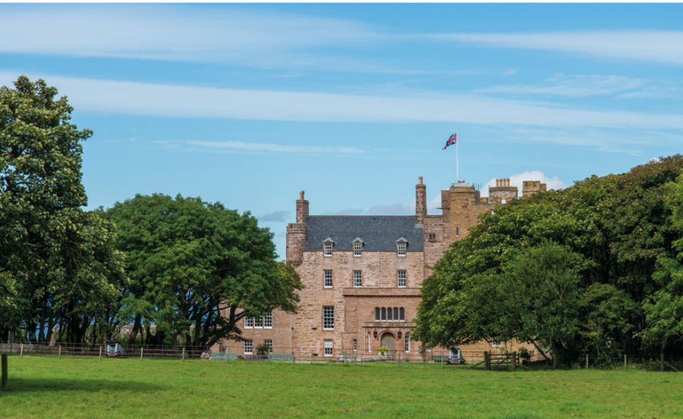
Castle of Mey and Harrow Harbour