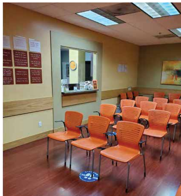
CLASSROOM / WAITING AREA

For the Sale Information, Please Contact Exclusive Agents: