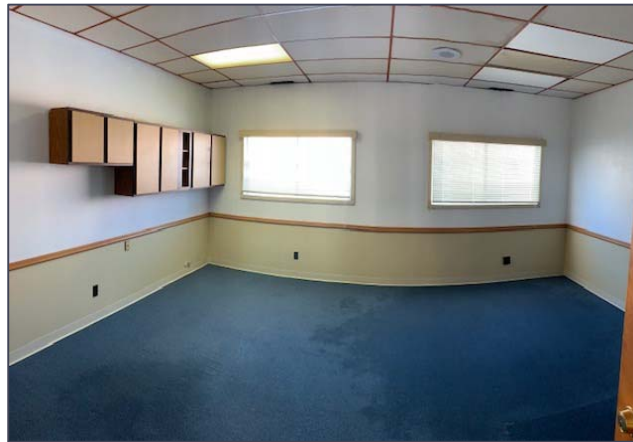
Medical records room