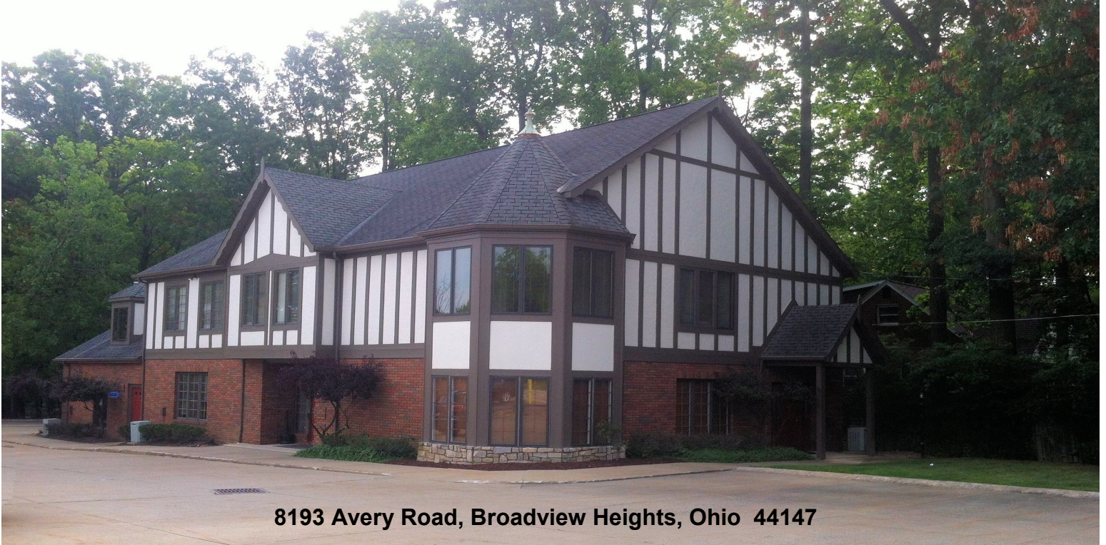
8193 Avery Road, Broadview Heights, Ohio 44147

Broadview Heights, Ohio 44147 (Cuyahoga County)