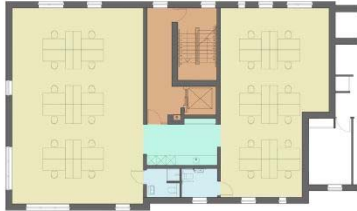
SECOND & THIRD FLOOR