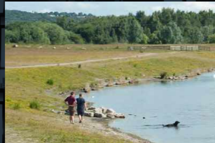
Background image: The Digital Media Centre in Barnsley