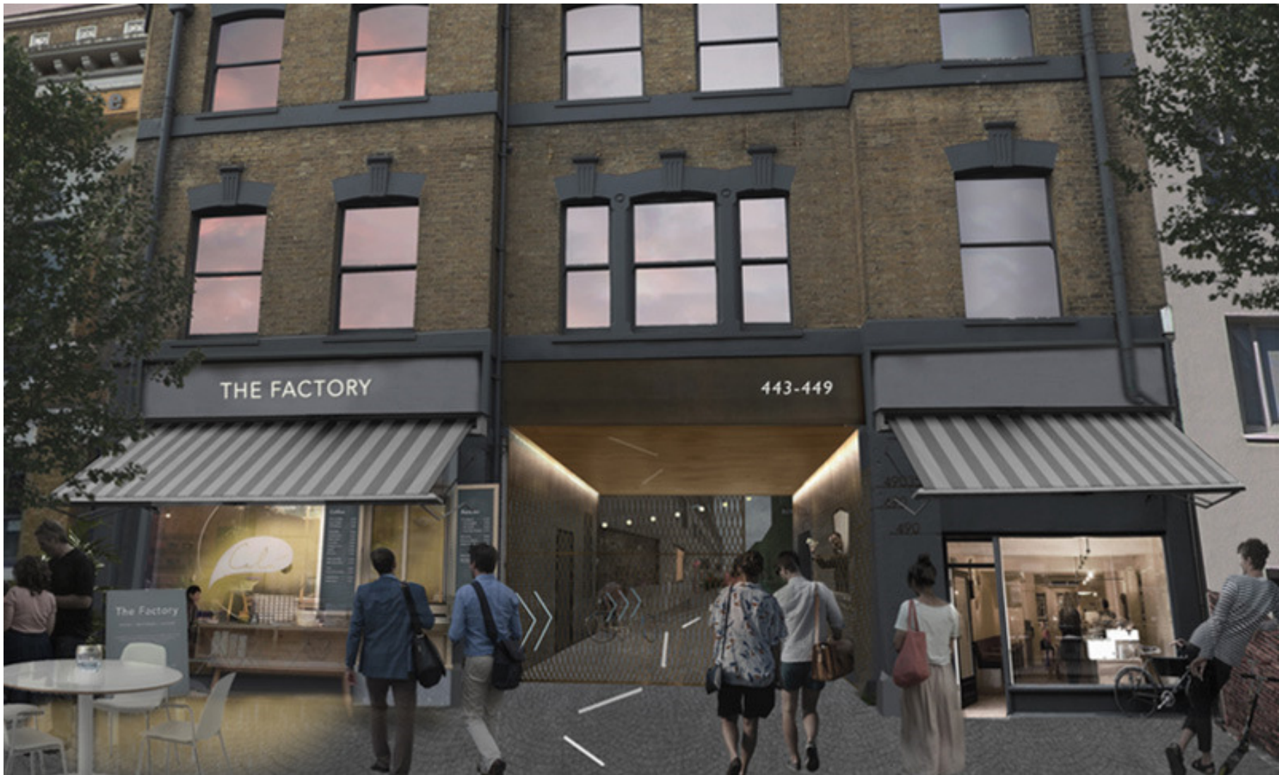
The former factory will have a gated entrance with public café and newly landscaped public realm to create an inviting arrival