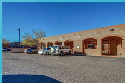
REAR & STREET PARKING