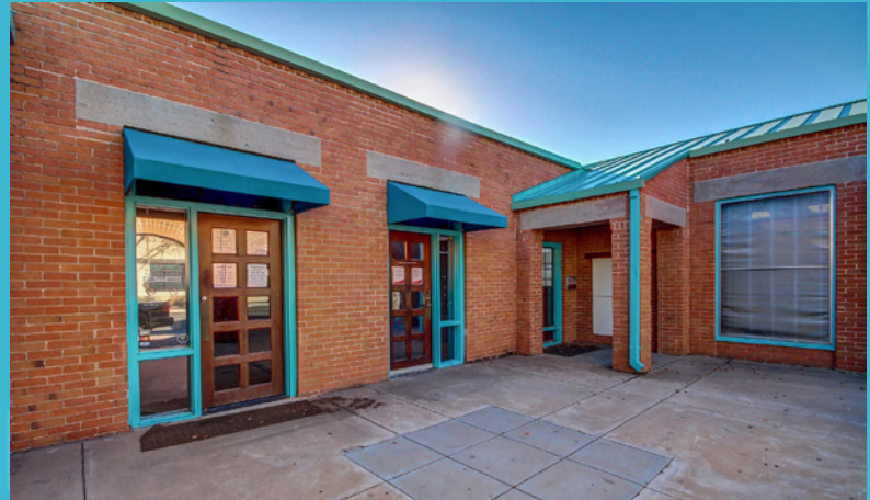
COURTYARD ENTRANCE OFF GLENDALE AVE