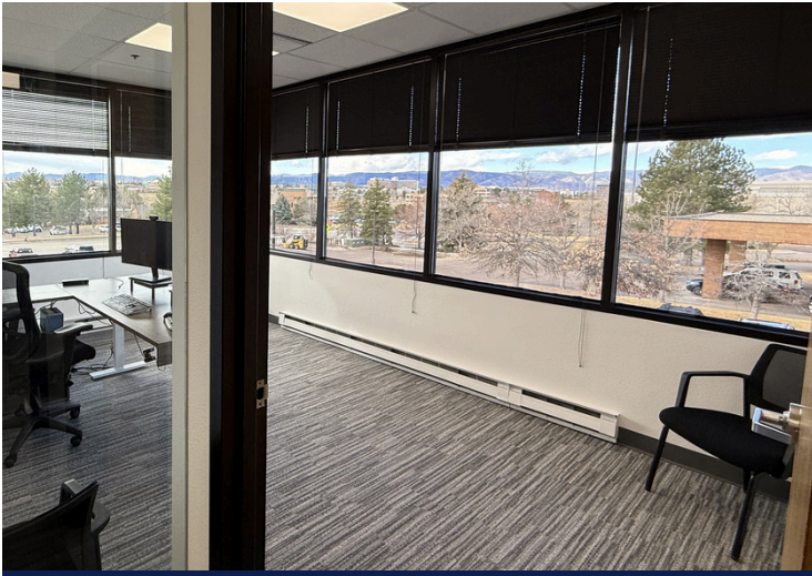
Executive Corner Office