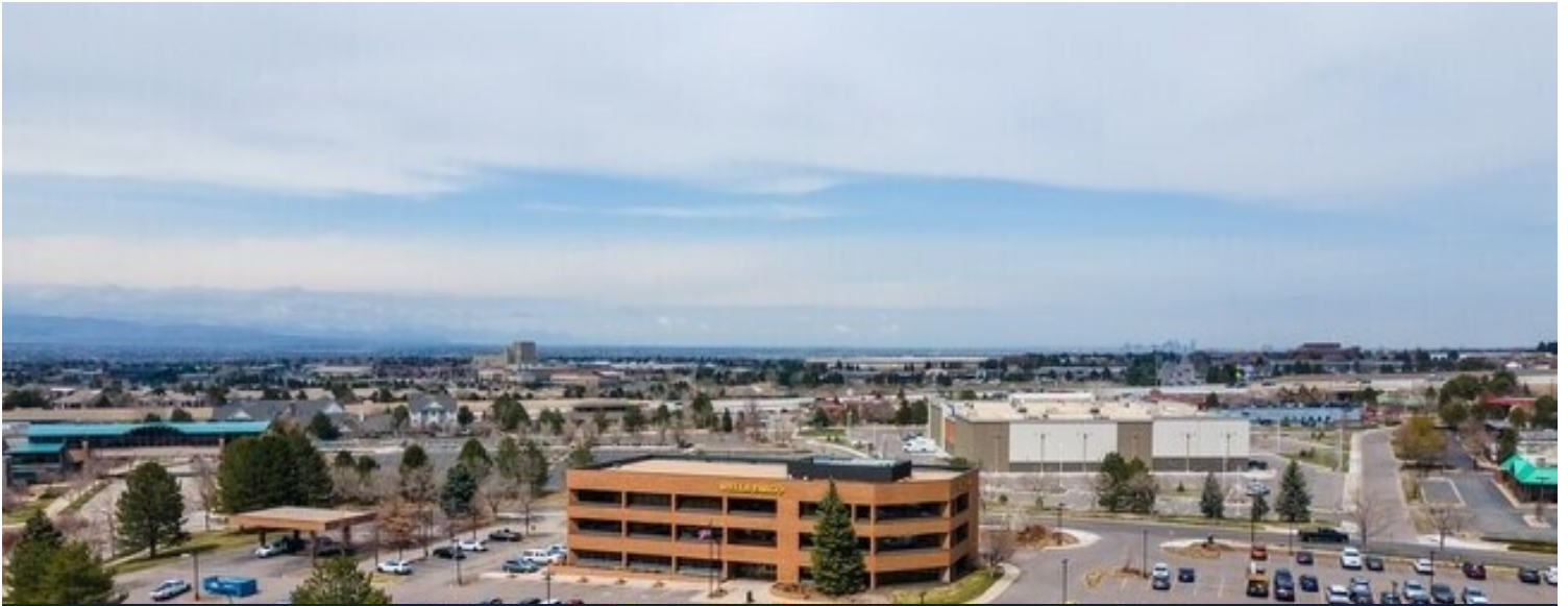
Aerial View — 66 W. Springer Drive, Highlands Ranch, CO | Wells Fargo Center