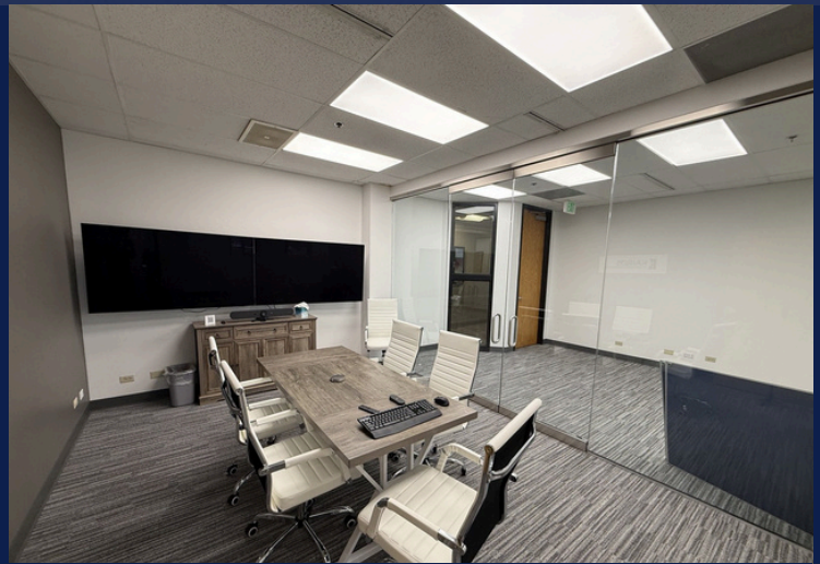
Glass-Walled Conference Room