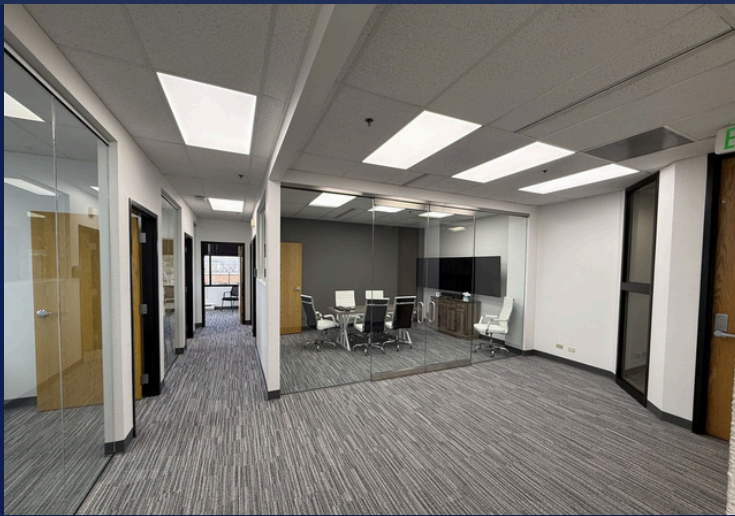
Open Reception & Suite Interior

Suite 210 | 66 W. Springer Drive | Highlands Ranch, Colorado 80129