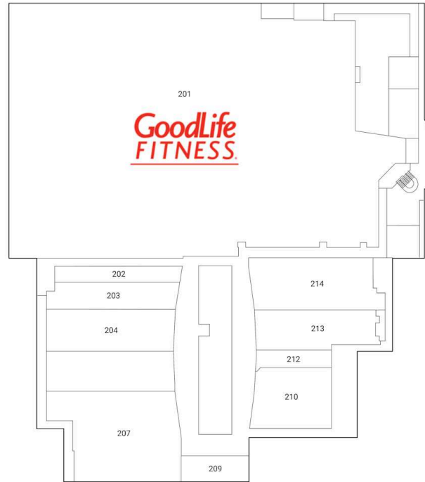
Office Galleria 2nd Floor