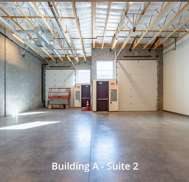
Building A - Suite 2