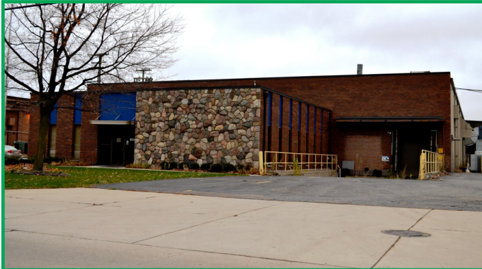
PHOTOS - Building A