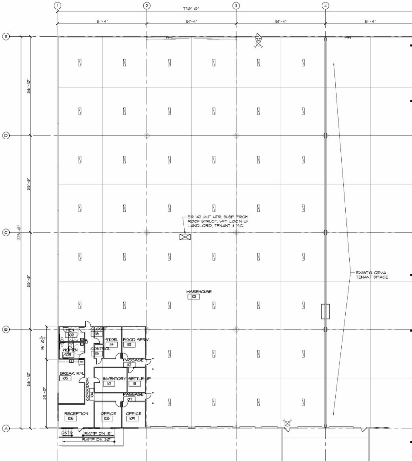
1 OVERALL TENANT SPACE FLOOR PLAN SCALE: 1/16" = 1'-0"