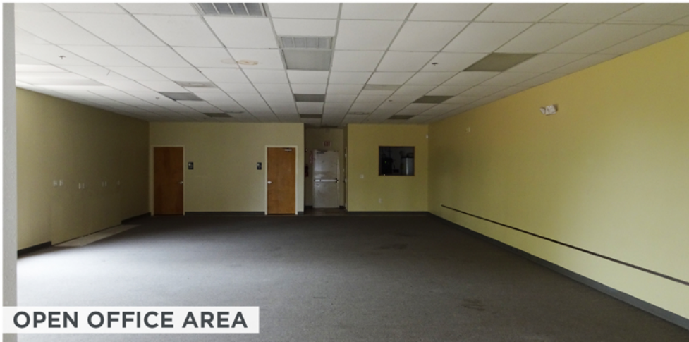
OPEN OFFICE AREA