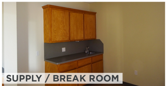
SUPPLY / BREAK ROOM