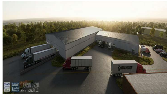
Rendering – For Illustration Only

Price $8 per Sq ft + Triple Net Triple Net Estimates TBD Use Covers Industrial, Manufacturing, Office/Warehouse Flexible Tenant Building Needs Construction Mgr. can work with tenants