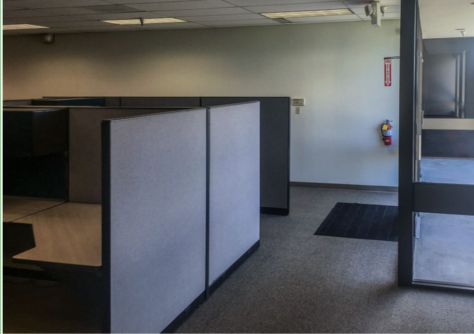
Open Area for Cubicle Space