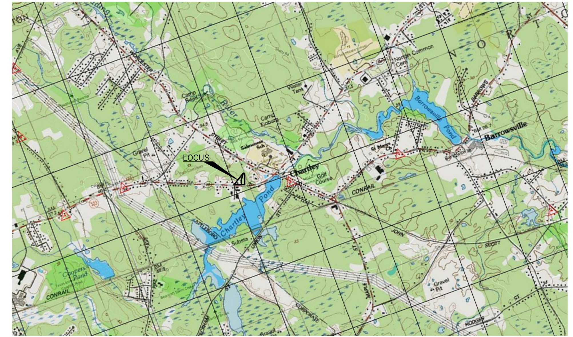
LOCUS MAP SCALE: 1" = 2000'