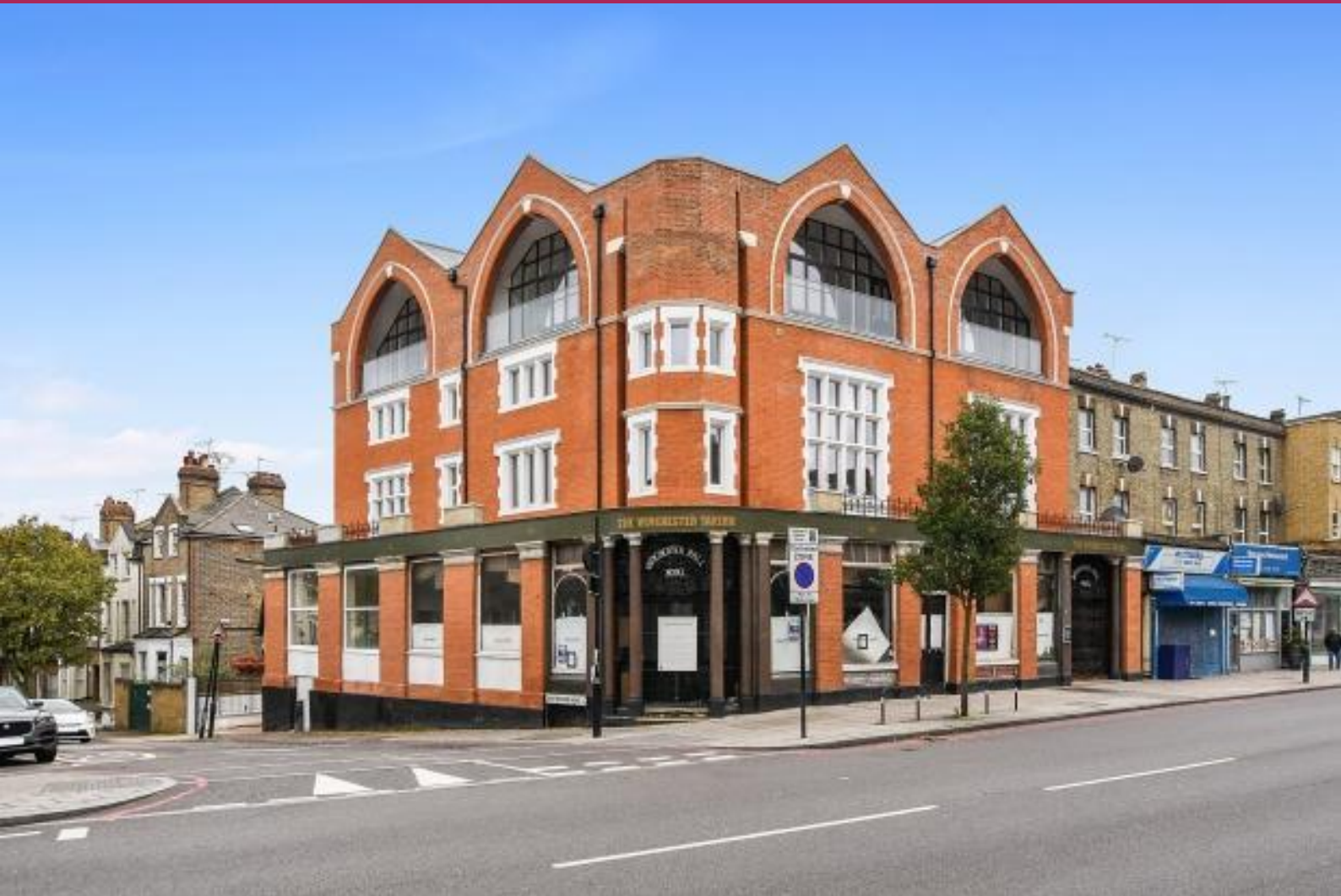
Winchester Hall Tavern, 206 Archway Road, Highgate, London, N6 5BA