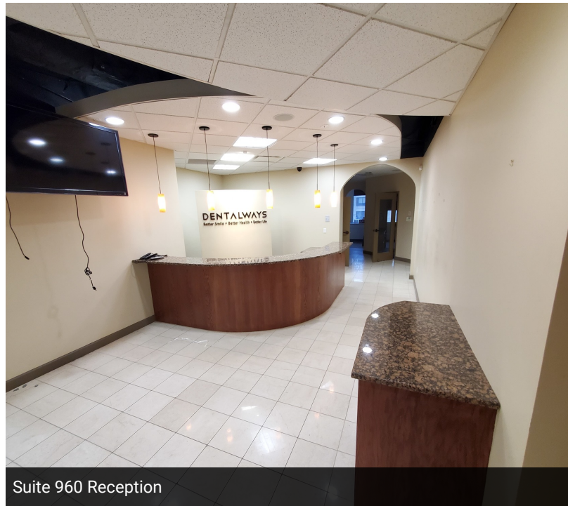
Suite 960 Reception

Information is deemed reliable but is not guaranteed. Agency Disclosure: RPM Group is the agent for the owner of the property described herein.