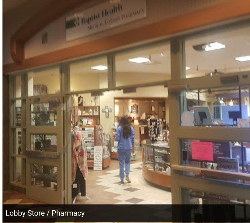
Lobby Store / Pharmacy