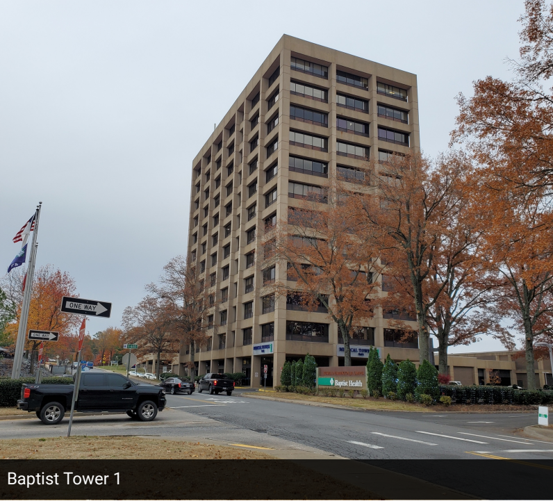
Baptist Tower 1