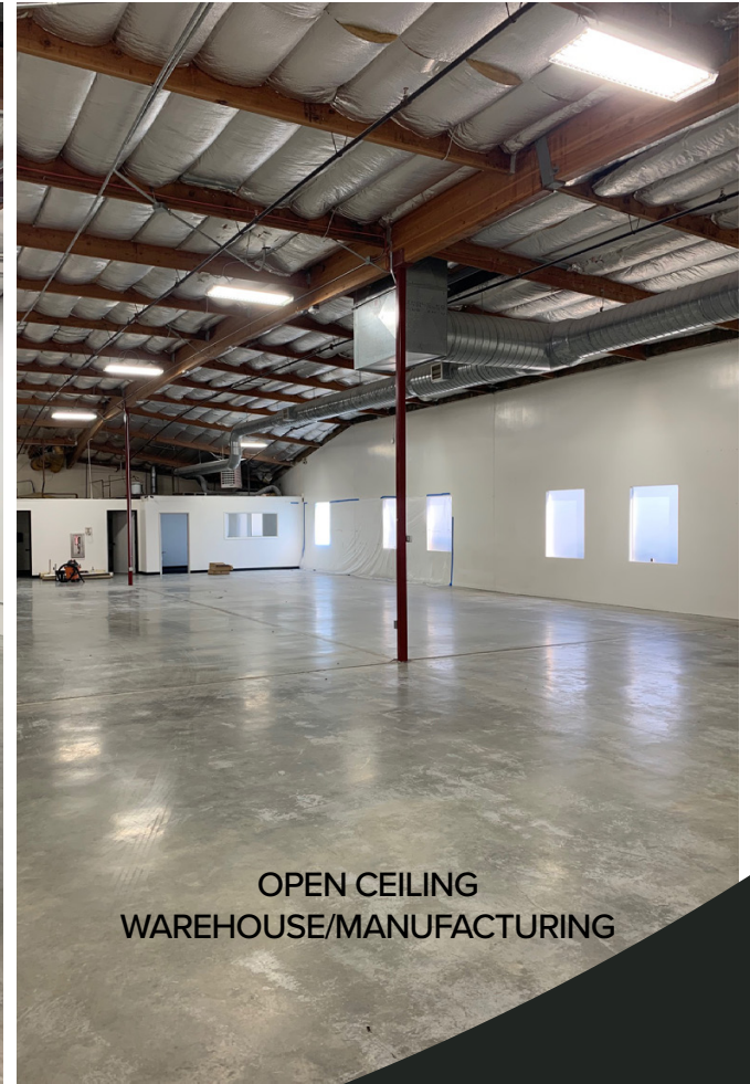
OPEN CEILING WAREHOUSE/MANUFACTURING