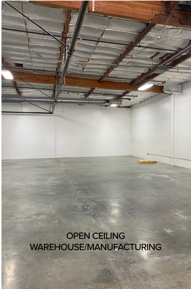
OPEN CEILING WAREHOUSE/MANUFACTURING