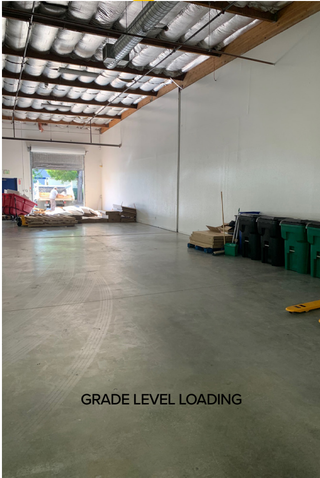
GRADE LEVEL LOADING