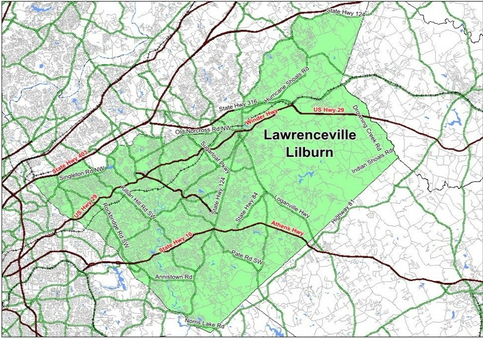
Lawrenceville/Lilburn Office Submarket

Per Copyright © 2014 CoStar Realty Information, Inc. All rights reserved.