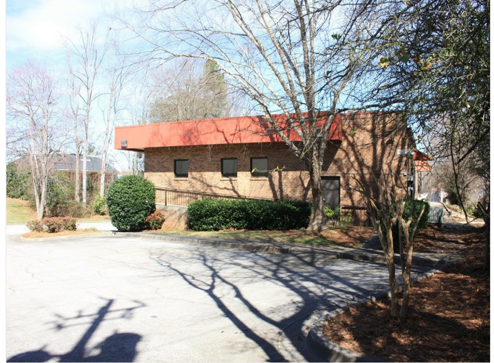
Additional Parking Lots