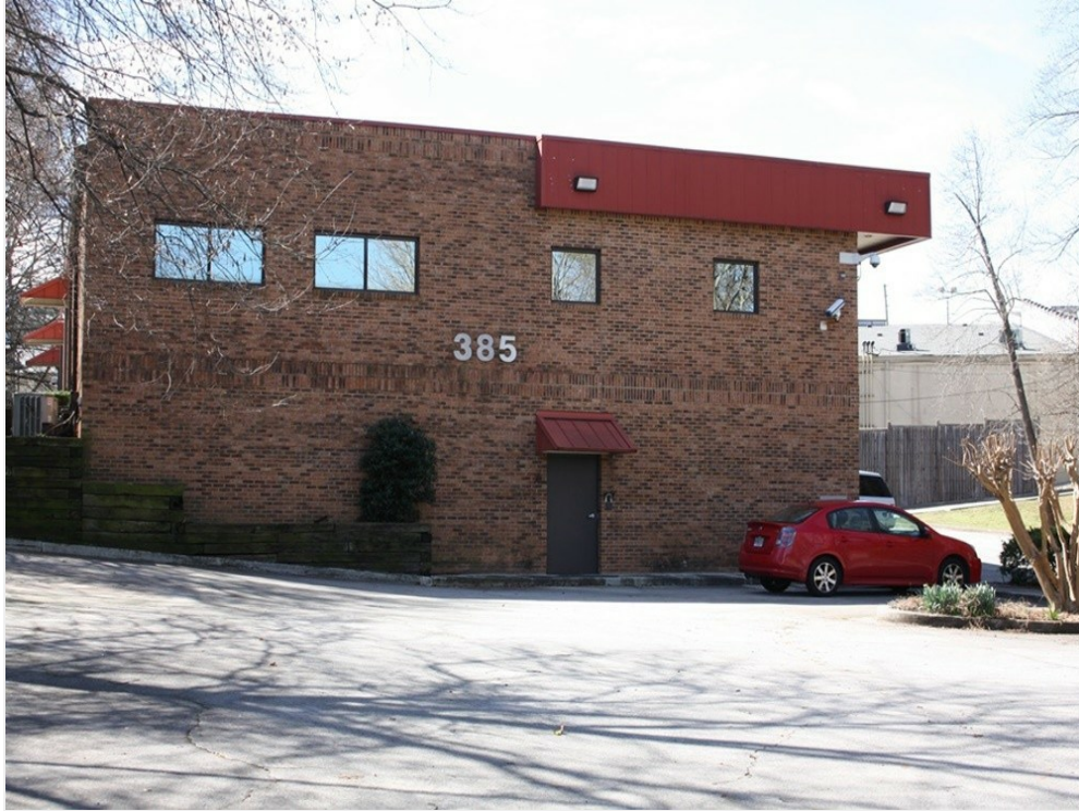
Additional Parking Lots