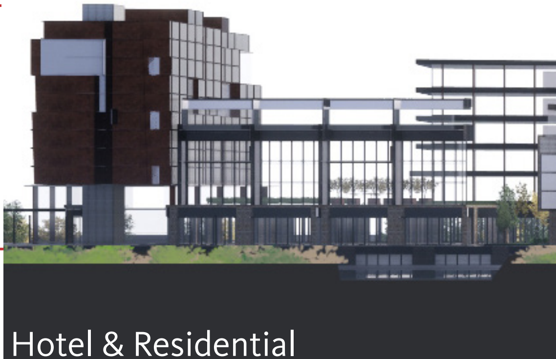
Hotel & Residential