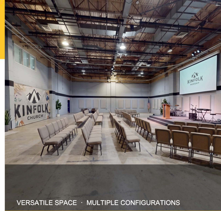
VERSATILE SPACE · MULTIPLE CONFIGURATIONS

Century 21 Homes and Land 5150 US-60 Ste 240 Barboursville, WV 25504 Patrick Lucas, Broker