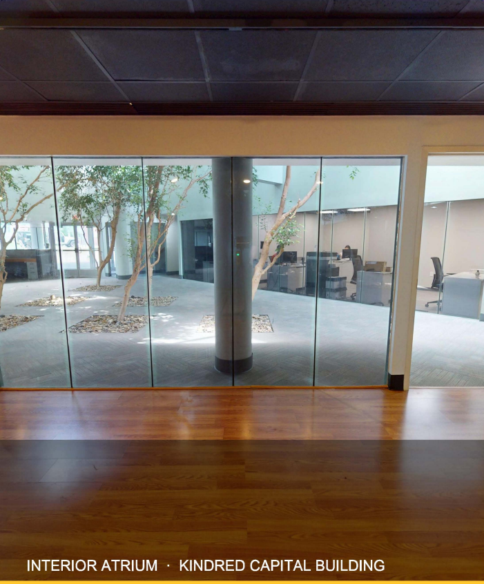
INTERIOR ATRIUM · KINDRED CAPITAL BUILDING