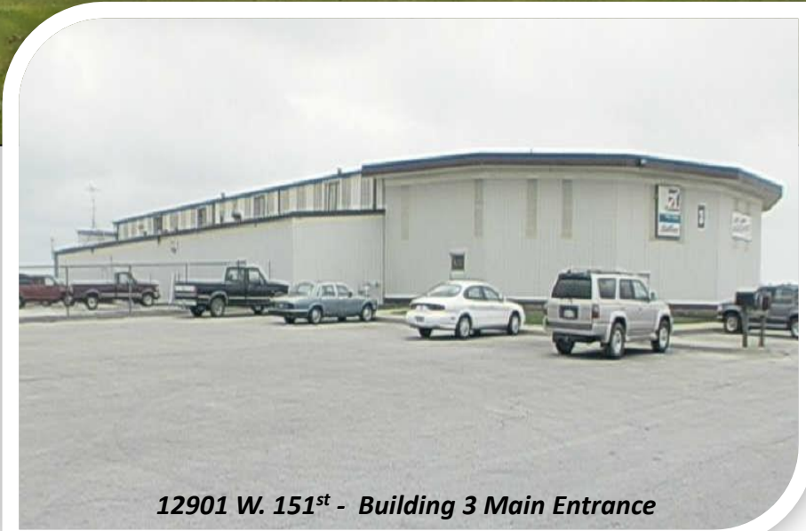
12901 W. 151 st - Building 3 Main Entrance

Please do not disturb Landlord or Tenant Call for appointment