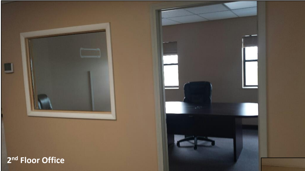
2 nd Floor Office