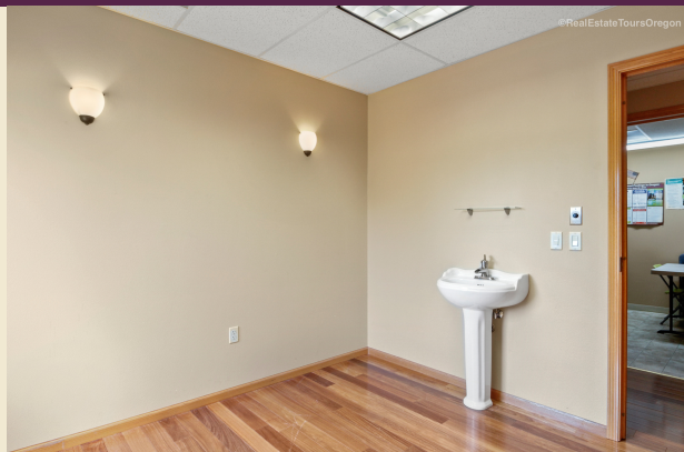
OFFICE WITH PEDESTAL SINK