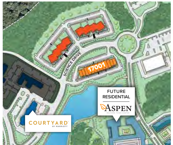
North Melford Town Center