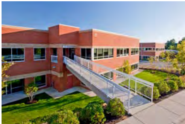
16900 Science Drive

Melford Town Center’s two-story office buildings located along Science Drive offer an over-and-under style of architecture. This style provides direct street access from the second floor.