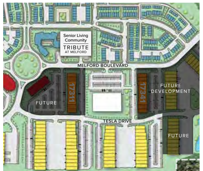
Southeast Melford Town Center