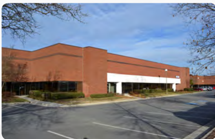
13504 South Point Boulevard