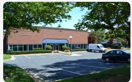
14201 South Lakes Drive