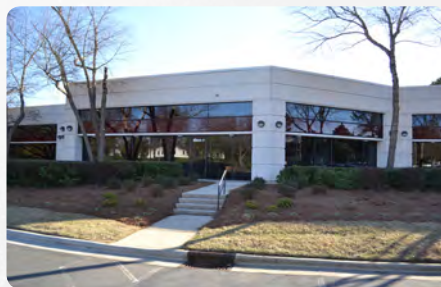
13900 South Lakes Drive