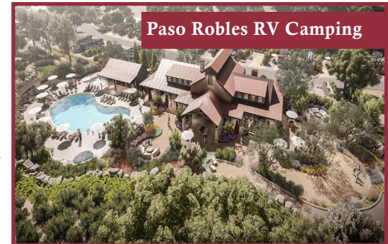
Paso Robles RV Camping

RV Camping - For those whose traveling ways mean hittin' the dusty trail RV style. Pull in and park in one of Paso's highly rated RV parks. Cava Robles, Wine Country RV Resort, Vines RV Resort, and Paso Robles RV Ranch & Campground are just a few in the area.