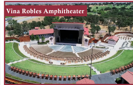
Vina Robles Amphitheater

Entertainment - Nestled on a picturesque, oak-dotted hillside, featuring a variety of music and entertainment. Vina Robles Amphitheater was named one of North America's "Must Play Venues of 2016" by music industry publication Amplify.