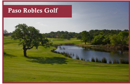
Paso Robles Golf

GOLF - The scenic town of Paso Robles is one of California's best kept secrets. With four golf courses you have a reason to stay awhile and enjoy the local wine and food scene.