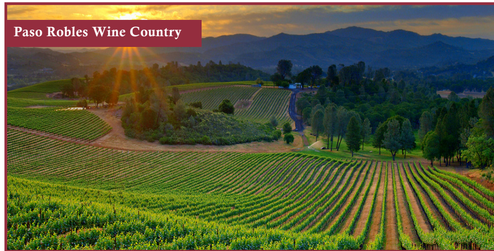
Paso Robles Wine Country

Entertainment - Nestled on a picturesque, oak-dotted hillside, featuring a variety of music and entertainment. Vina Robles Amphitheater was named one of North America's "Must Play Venues of 2016" by music industry publication Amplify.