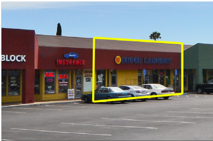
*SANDAG 2013 Estimate