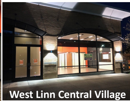
West Linn Central Village