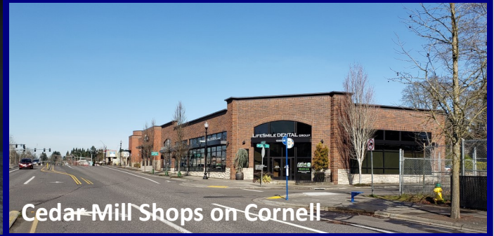
Cedar-Mill Shops on Cornell