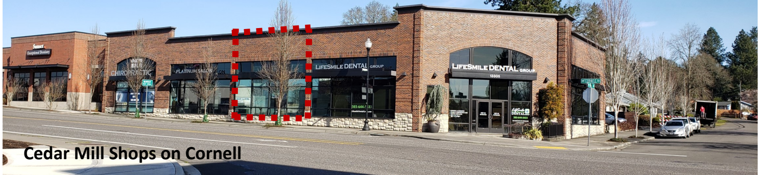
Cedar Mill Shops on Cornell