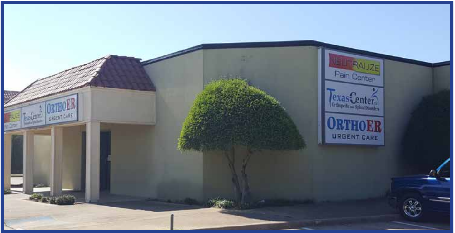
ADDITIONAL EXTERIOR VIEW