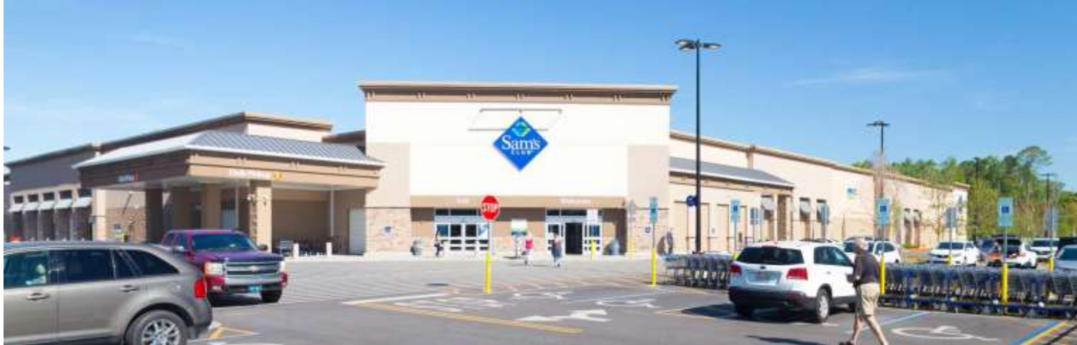
Outparcel 325,000 sf shopping center