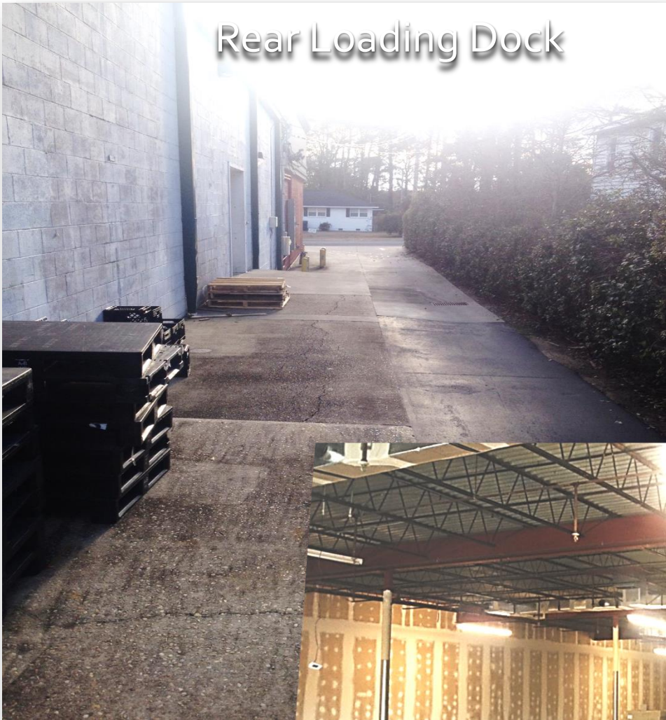
Rear Loading Dock