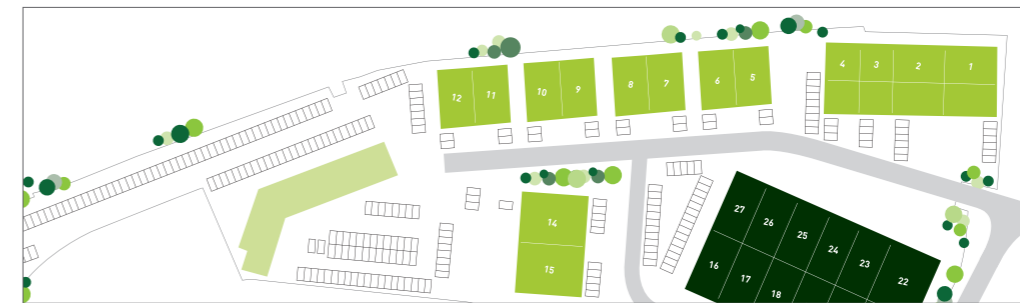
Phase 1 site plan