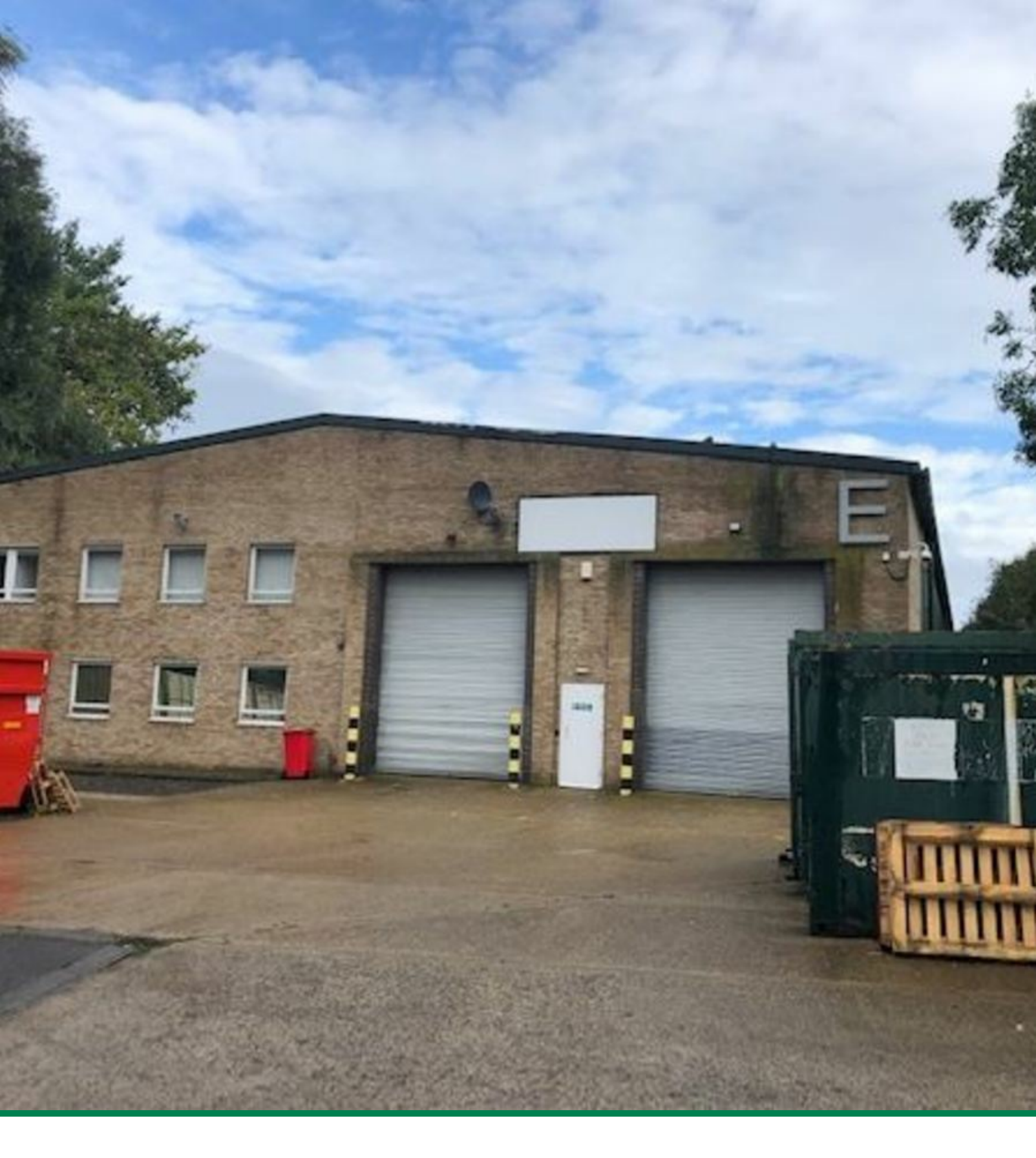
AVAILABLE TO LET