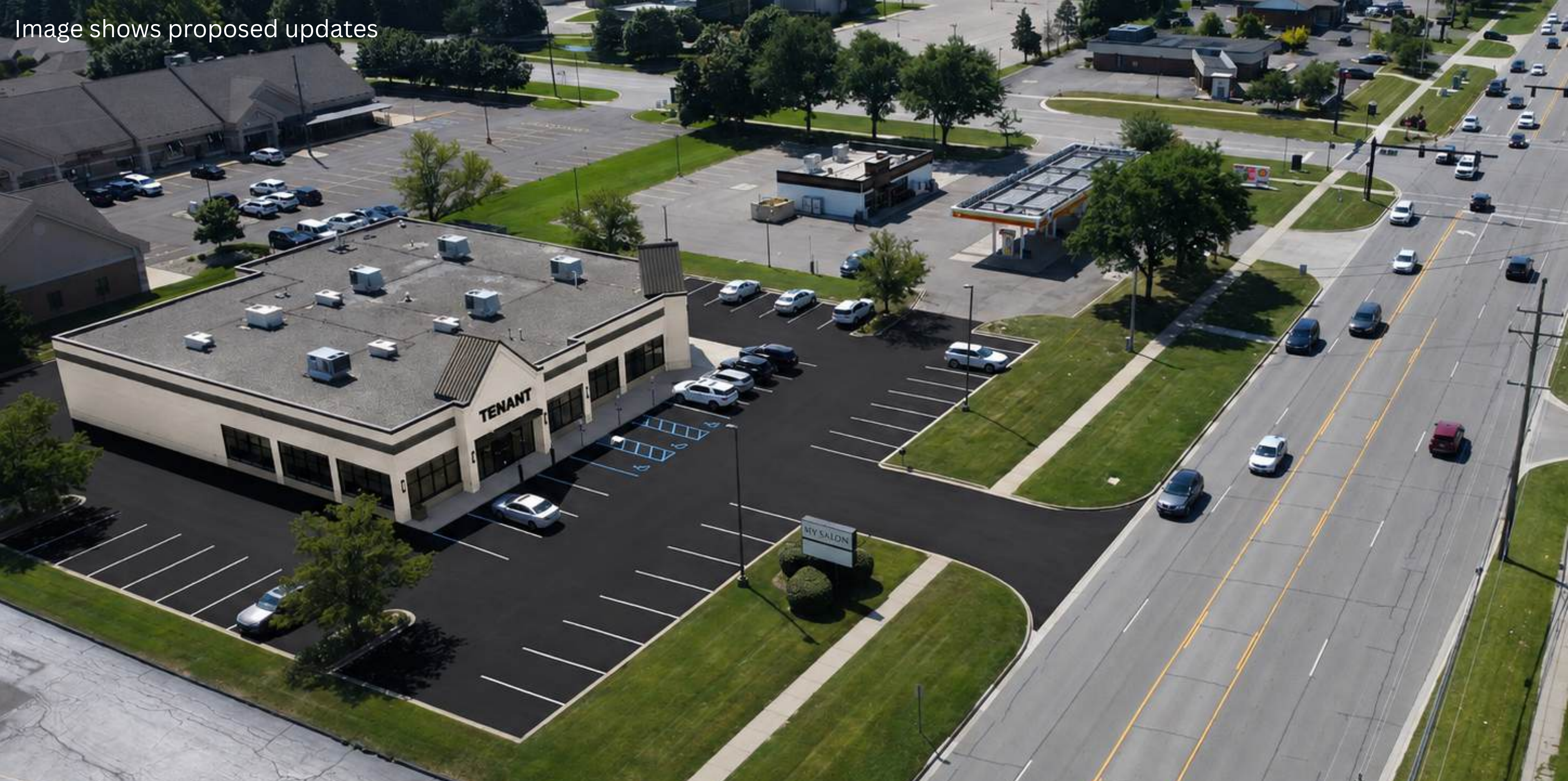
Image shows proposed updates