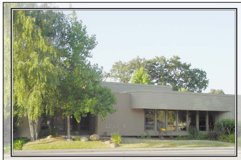
View from Mt. Diablo Boulevard

Curtis Berrien • (925) 227-7814 • cberrien@cmrealty.com