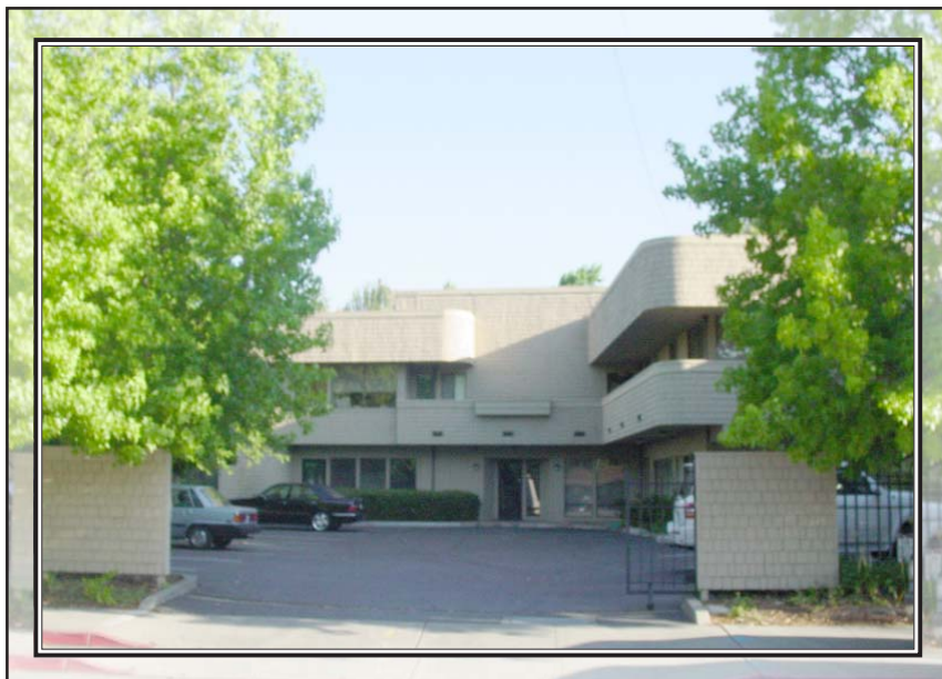
View from Golden Gate Way