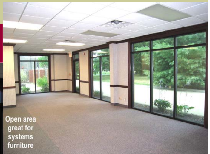
Open area great for systems furniture